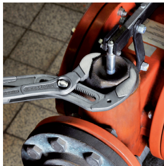
Fast and firm adjustment directly on the workpiece