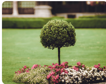
Residential and Commercial Lawns and Gardens