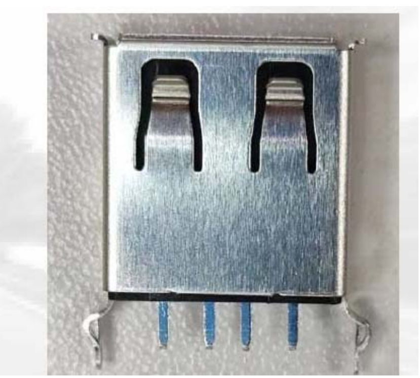
New Tooling Product