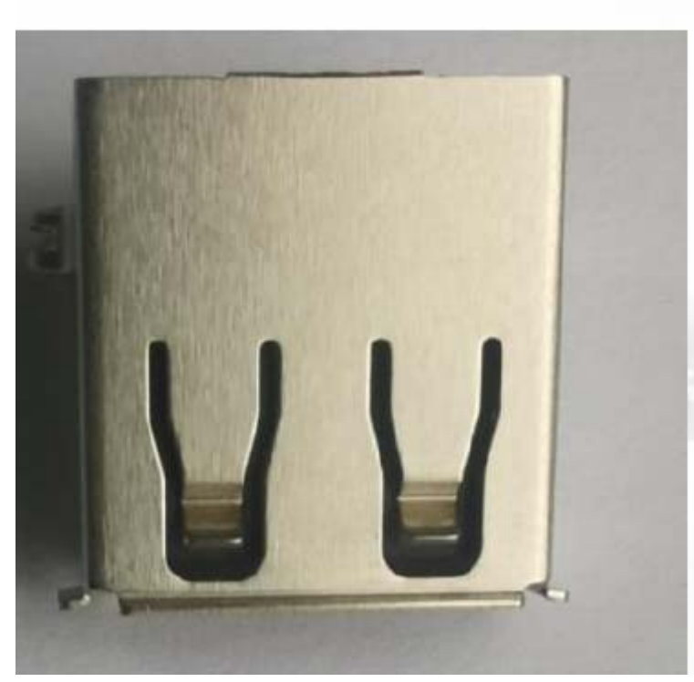
Old Tooling Product