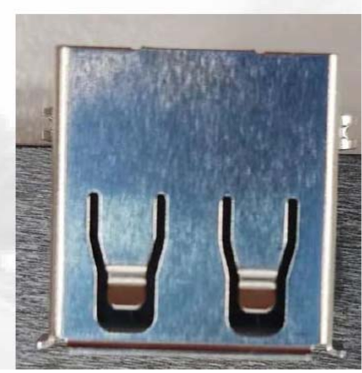
New Tooling Product