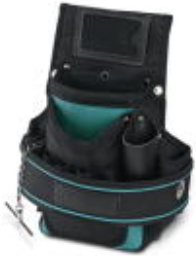
Tool waist bag, unequipped

Please be informed that the data shown in this PDF Document is generated from our Online Catalog. Please find the complete data in the user's documentation. Our General Terms of Use for Downloads are valid ( http://phoenixcontact.com/download )