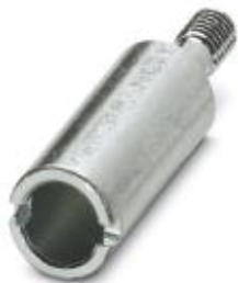
Coding socket for coding up to 16 connectors

Please be informed that the data shown in this PDF Document is generated from our Online Catalog. Please find the complete data in the user's documentation. Our General Terms of Use for Downloads are valid ( http://phoenixcontact.com/download )