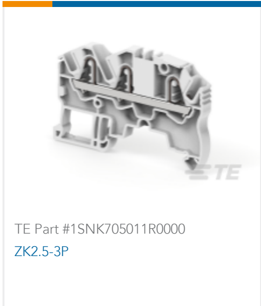
TE Part #1SNK705011R0000 ZK2.5-3P