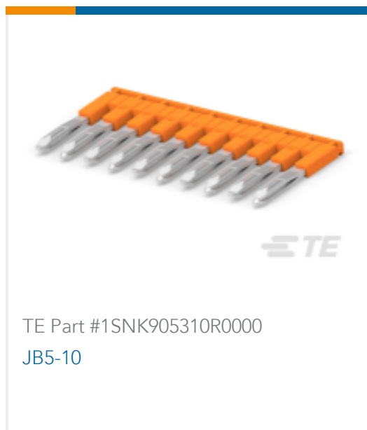
TE Part #1SNK905310R0000 JB5-10