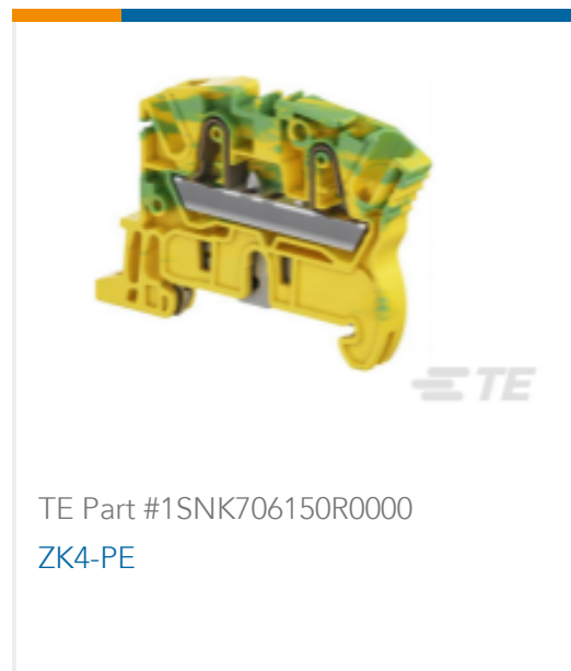
TE Part #1SNK706150R0000 ZK4-PE