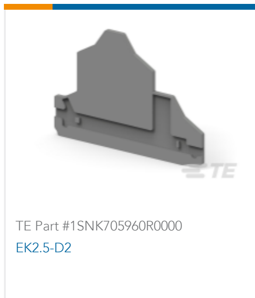
TE Part #1SNK705960R0000 EK2.5-D2