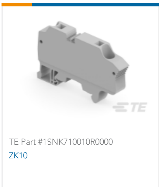
TE Part #1SNK710010R0000 ZK10