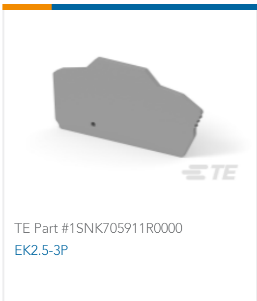
TE Part #1SNK705911R0000 EK2.5-3P