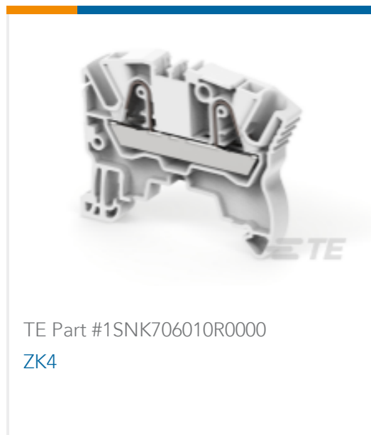
TE Part #1SNK706010R0000 ZK4