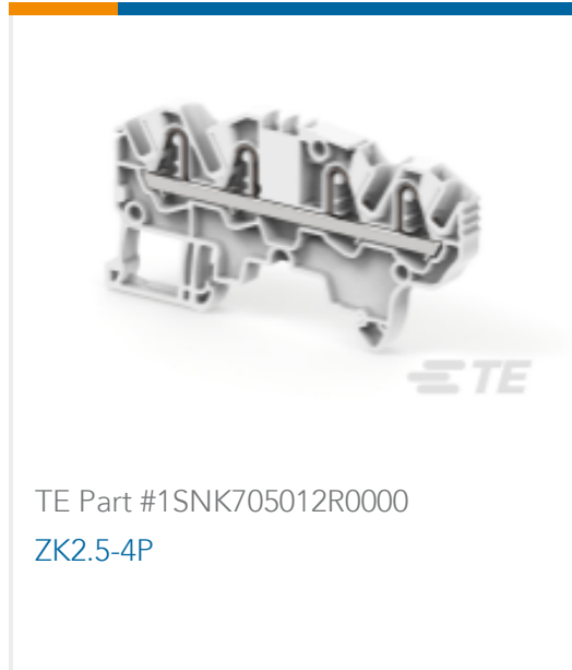
TE Part #1SNK705012R0000 ZK2.5-4P