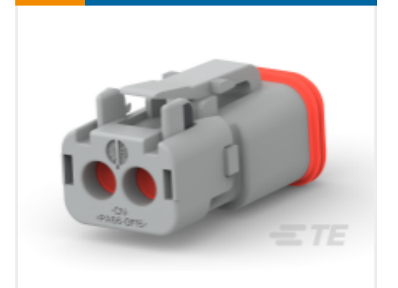
TE Part # CAT-J41-DDPC DEUTSCH DT Plug Connectors