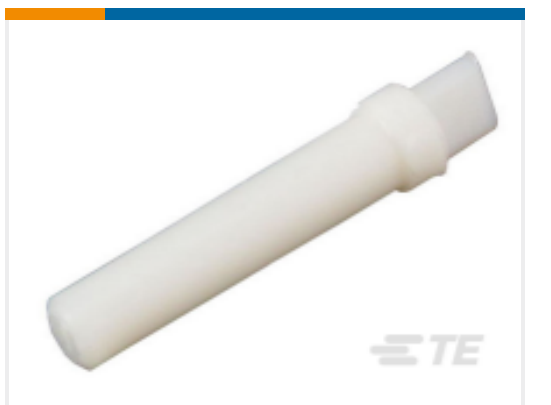
TE Part # 776364-1 SEALING PLUG, SZ 20 CAVITY