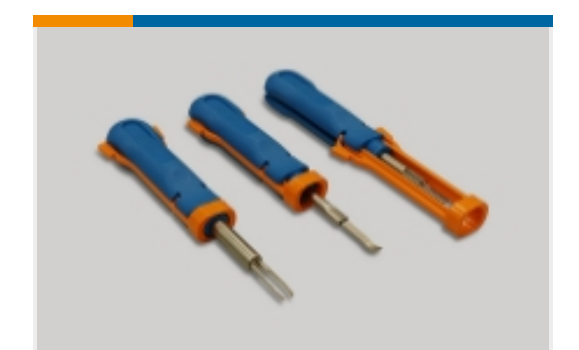
Insertion & Extraction Tools(3)