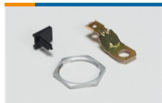
Other Automotive Connector Accessories(16)