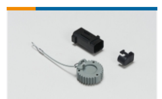
Automotive Connector Caps & Covers (107)