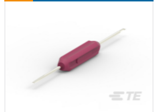
TE Part # DT-RT1 EXT TOOL, FRONT RELEASE