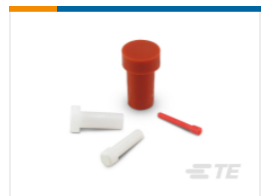
TE Part # CAT-D48-SP729 DEUTSCH Sealing Plugs