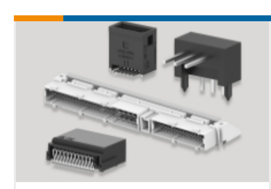
PCB Headers & Receptacles(102)