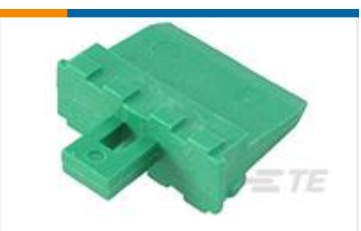
TE Part # W8P WEDGE LOCK, 8P, REC, GRN, DT