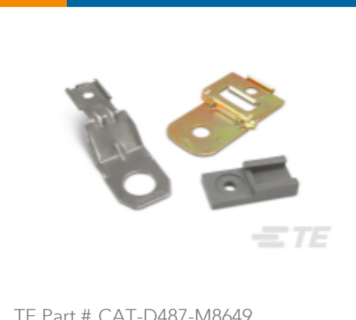
TE Part # CAT-D487-M8649 DEUTSCH DT Mounting Clips