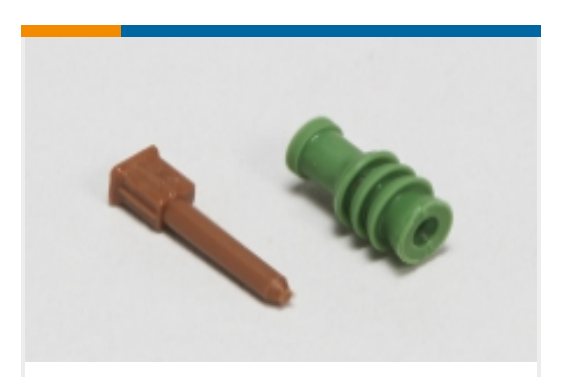
Automotive Seals & Cavity Plugs(5)