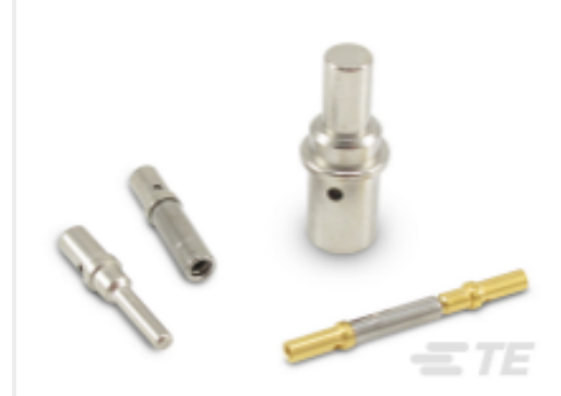
TE Part # CAT-D48-ST273 DEUTSCH Solid Contacts