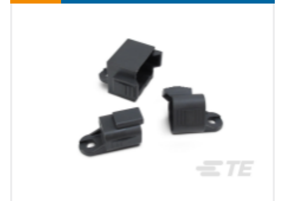
TE Part # CAT-D487-P729 Dust Caps — DEUTSCH DT