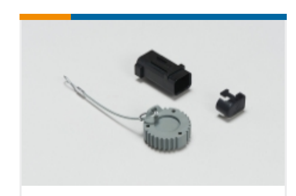
Automotive Connector Caps & Covers (107)