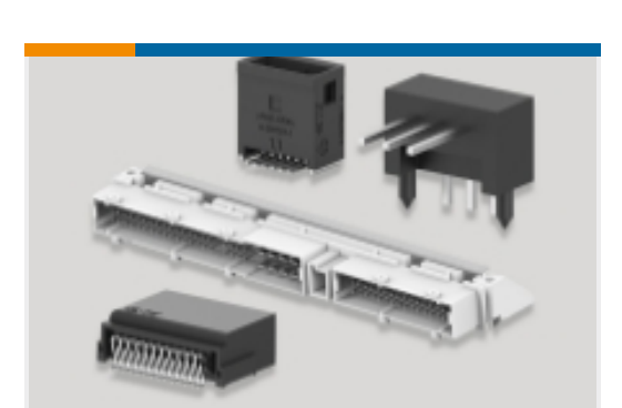
PCB Headers & Receptacles(102)