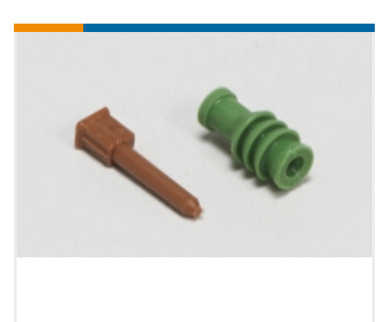
Automotive Seals & Cavity Plugs(5)