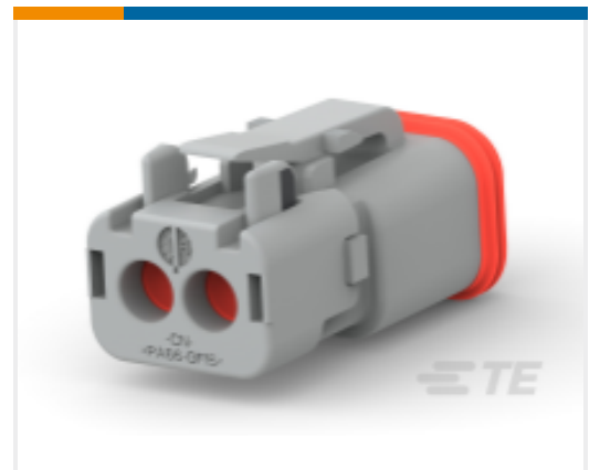
TE Part # CAT-J41-DDPC DEUTSCH DT Plug Connectors