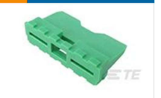
TE Part # W12P WEDGE LOCK, 12P, REC, GRN, DT