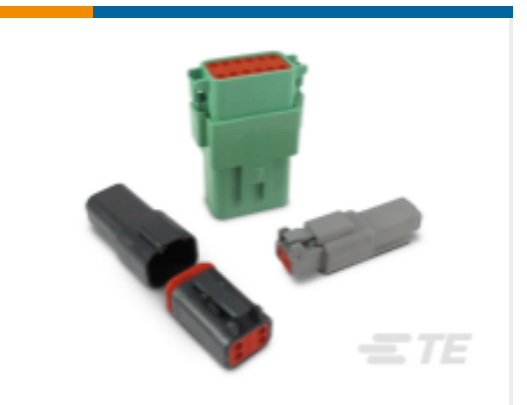
TE Part # CAT-D487-CH8172 DEUTSCH DT Series Housings & Connectors

TE Part # CAT-D48-SFT273 DEUTSCH Stamped and Formed Contacts