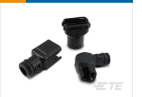
TE Part # CAT-D487-B128 DEUTSCH DT Backshells