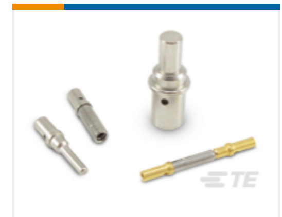
TE Part # CAT-D48-ST273 DEUTSCH Solid Contacts