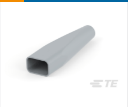
TE Part # DT12P-BT-EN BOOT, 12P, REC, ST, LONG, GRY