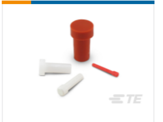
TE Part # CAT-D48-SP729 DEUTSCH Sealing Plugs