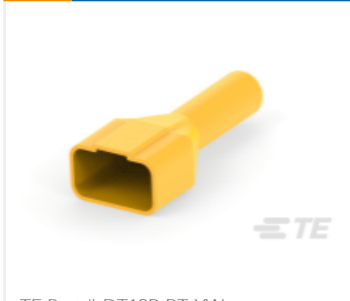
TE Part # DT12P-BT-YW BOOT, 12P, REC, ST, YEL