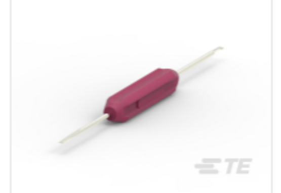
TE Part # DT-RT1 EXT TOOL, FRONT RELEASE