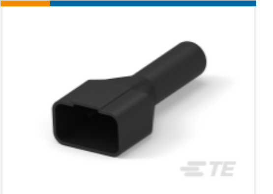
TE Part # DT12P-BT-BK BOOT, 12P, REC, ST, BLK