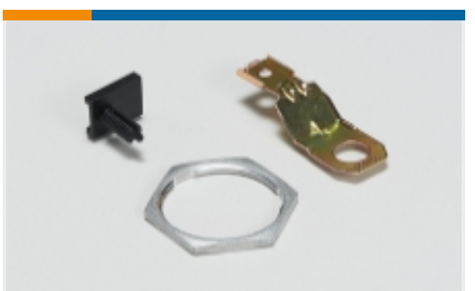
Other Automotive Connector Accessories(16)