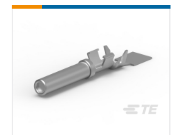
TE Part # CAT-J67-DSCC16 DEUTSCH Size 16 Crimp Contacts