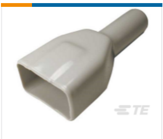
TE Part # DT12P-BT BOOT, 12P, REC, ST, GRY