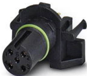
Sensor/actuator flush-type socket, 5-pos., A-coded, with straight solder connection, only contact insert

Please be informed that the data shown in this PDF Document is generated from our Online Catalog. Please find the complete data in the user's documentation. Our General Terms of Use for Downloads are valid ( http://phoenixcontact.com/download )