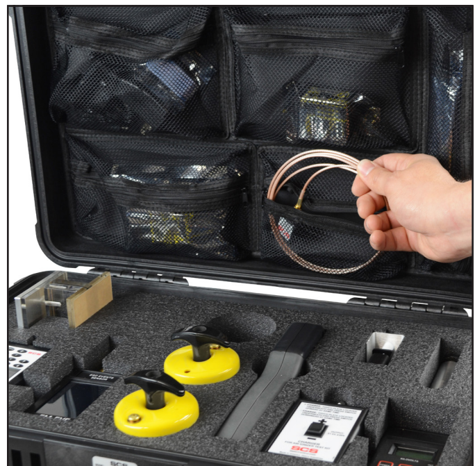
Figure 2. Using the EOS/ESD Assessment Kit's lid organizer

The ESD Program Standard ANSI/ESD S20.20 can be downloaded here: https://www.esda.org/standards/esda-documents/