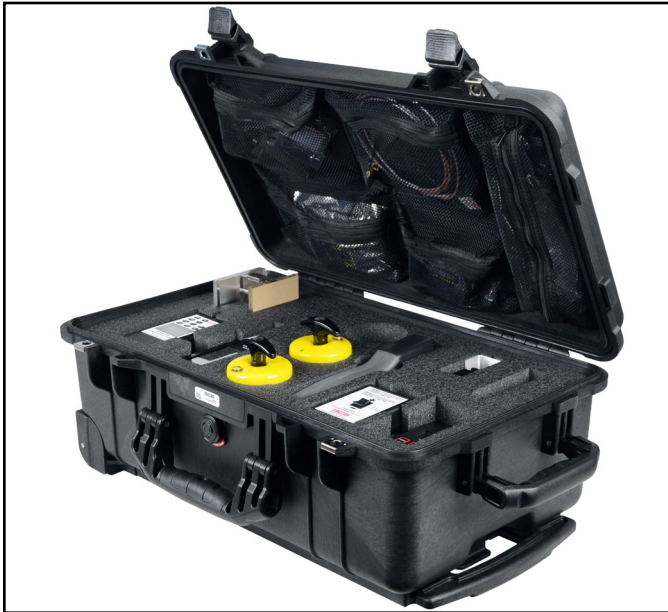
Figure 1. SCS 770045 EOS/ESD Assessment Kit