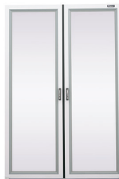
Dual Sliding Door