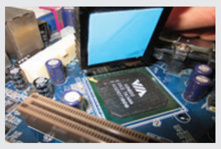
Sheet Size: 300mm x 400mm