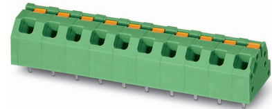
The figure shows 10-pos. standard item (without EX marking)

PCB terminal block, Push-in spring connection