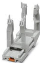
DIN rail mounting frame, type: B6 - B24, for contact inserts

Please be informed that the data shown in this PDF Document is generated from our Online Catalog. Please find the complete data in the user's documentation. Our General Terms of Use for Downloads are valid ( http://phoenixcontact.com/download )