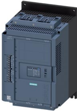
SIRIUS soft starter 200-600 V 77 A, 110-250 V AC Screw terminals Thermistor input