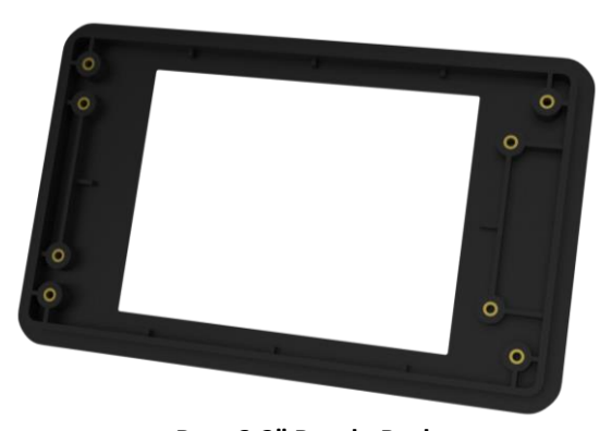
Bare 3.2" Bezel - Back