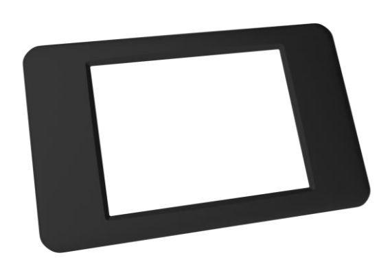
Bare 3.2" Bezel - Front