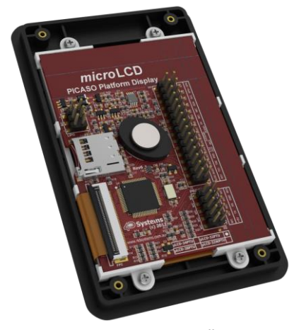
uLCD-32PTU Mounted in 3.2" Bezel - Back