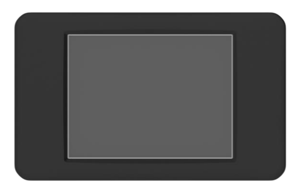
uLCD-32PTU Mounted in 3.2" Bezel - Front