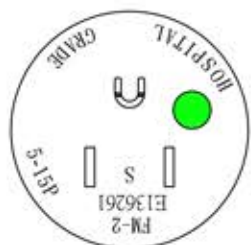
插頭端面圖 (Dimensions of Plug Face)

Insulation Thickness 0.76 mm Overall Diameter 3.45±0.10 mm