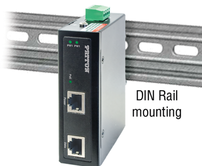
DIN Rail mounting

Visit patton.com to view our huge selection of network connectivity products and more.