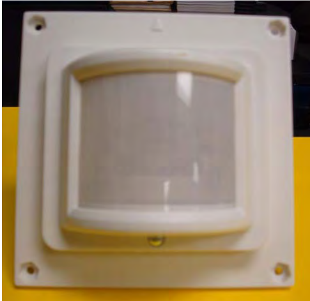
Figure 5. Assembled Flat 1.2" Lens Holder and Flat Lens