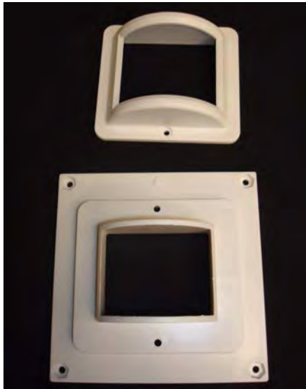
Figure 3. Flat 1.2" Lens Cap (Top) and Lens Base (Bottom)

The flat lens holder, shown in Figure 3, is a two-piece assembly that provides a 1.2" focal length mounting. Figure 4 shows the detail of the ZWA12GI12V4 lens, with its correct orientation.