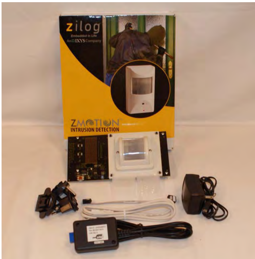
Figure 1. ZMOTION Intrusion Detection Development Kit Components