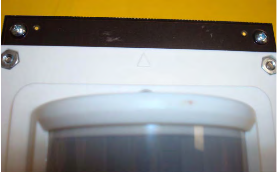
Figure 6. Top of Lens Holder on the ZMOTION Development Board