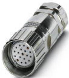
M23 socket, 19-pos., straight, freely configurable, with solder connection, for external cable diameter of 10 mm ... 14 mm

Please be informed that the data shown in this PDF Document is generated from our Online Catalog. Please find the complete data in the user's documentation. Our General Terms of Use for Downloads are valid ( http://phoenixcontact.com/download )