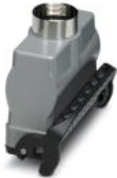
HEAVYCON B24 coupling housing, with single locking latch, height: 80.5 mm, with 1 x M25 gland, straight cable outlet

Please be informed that the data shown in this PDF Document is generated from our Online Catalog. Please find the complete data in the user's documentation. Our General Terms of Use for Downloads are valid ( http://download.phoenixcontact.com )