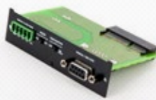
Industrial serial card