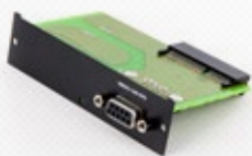
Low cost serial card