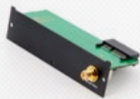
WLAN expansion card