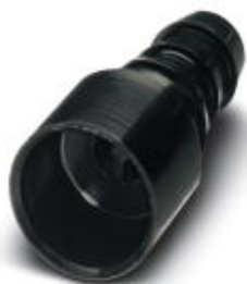
Pneumatic socket, for HC-M-PN2 module, internal hose diameter of 6.0 mm

Please be informed that the data shown in this PDF Document is generated from our Online Catalog. Please find the complete data in the user's documentation. Our General Terms of Use for Downloads are valid ( http://phoenixcontact.com/download )