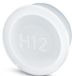
Plastic protection cap for connectors with M17 external thread

Please be informed that the data shown in this PDF Document is generated from our Online Catalog. Please find the complete data in the user's documentation. Our General Terms of Use for Downloads are valid ( http://phoenixcontact.com/download )