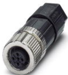
Connector, Universal, 5-position, Socket straight M12, A-coded, Push-in connection, knurl material: Zinc die-cast, nickel-plated, external cable diameter 4 mm ... 8 mm

Please be informed that the data shown in this PDF Document is generated from our Online Catalog. Please find the complete data in the user's documentation. Our General Terms of Use for Downloads are valid ( http://phoenixcontact.com/download )