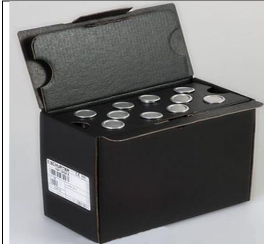
Packaging size: 83x165x120 mm