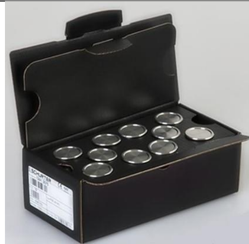
Packaging size: 83x165x60 mm