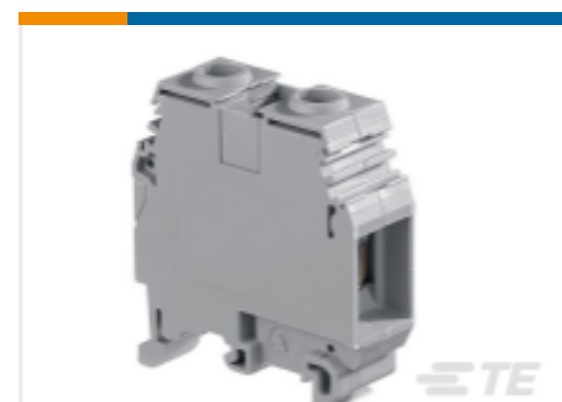
TE Part #1SNA115124R0700 M35/16