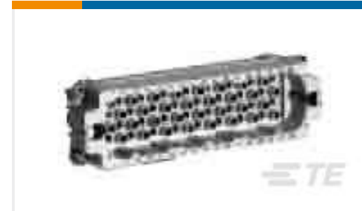
TE Part #2-1103032-3 HD.64.STI.C