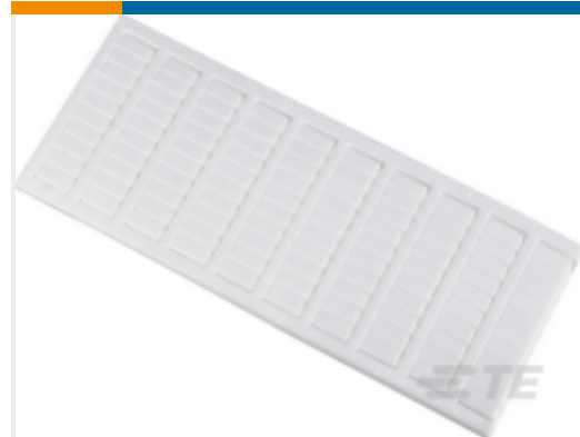
TE Part #1SNK145011R0000 MC512PA 1->100 Horizontal