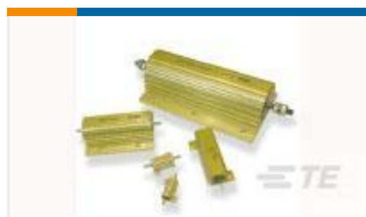
TE Part #2-1630024-4 HSC250 4R7 5%