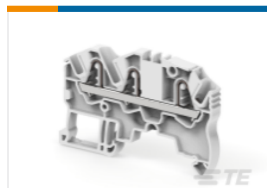
TE Part #1SNK705011R0000 ZK2.5-3P