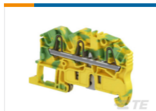
TE Part #1SNK705151R0000 ZK2.5-PE-3P