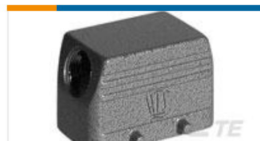
TE Part #2-1106430-4 HB.10.STS.1.M20.G