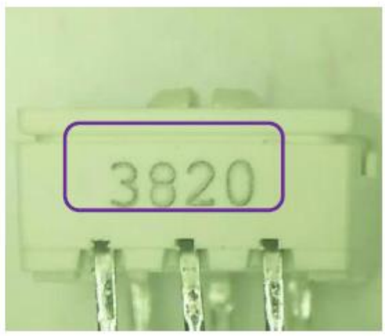
Table 2- New Product Structure

Date code laser marking will be shown on top of cover.