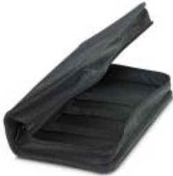
Tool box, unequipped

Please be informed that the data shown in this PDF Document is generated from our Online Catalog. Please find the complete data in the user's documentation. Our General Terms of Use for Downloads are valid ( http://phoenixcontact.com/download )