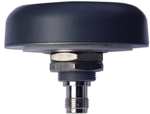
TW3710 / TW3712 Dimensions (mm)

The antennas are housed in a through-hole mount, weather-proof enclosure for permanent installations. L Bracket or Pipe Mount adapters (part numbers 23-0040-0, 23-0065-0 respectively) are available for non-rooftop installation. A 100mm ground plane is recommended for non-roof-top installations.