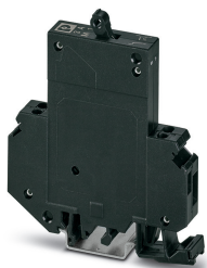
Thermomagnetic circuit breaker, 1-pos., normal blow, 1 N/C contact, with universal foot for mounting on NS 32 or NS 35

Please be informed that the data shown in this PDF Document is generated from our Online Catalog. Please find the complete data in the user's documentation. Our General Terms of Use for Downloads are valid ( http://phoenixcontact.com/download )