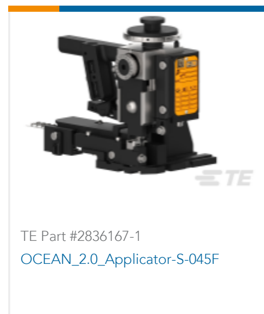
TE Part #2836167-1 OCEAN_2.0_Applicator-S-045F