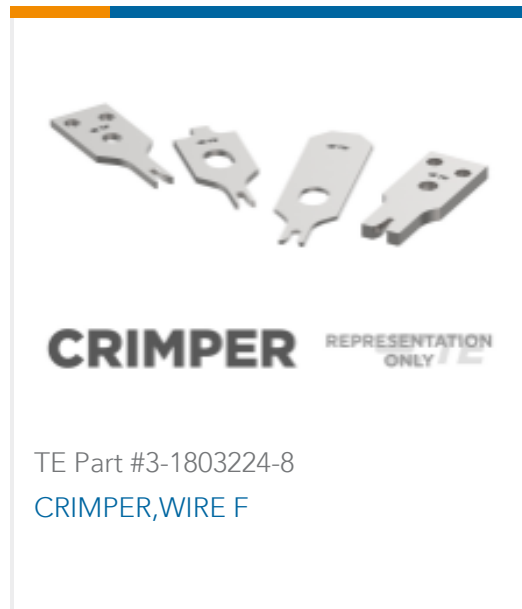
TE Part #3-1803224-8 CRIMPER, WIRE F