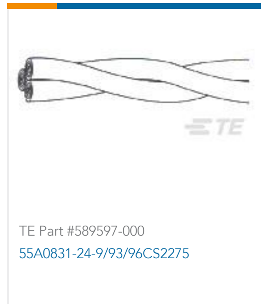
TE Part #589597-000 55A0831-24-9/93/96CS2275