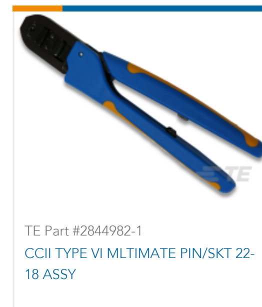
TE Part #2844982-1 CCII TYPE VI MLTIMATE PIN/SKT 22- 18 ASSY