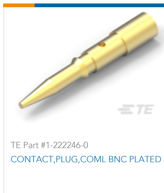
TE Part #1-222246-0 CONTACT, PLUG, COML BNC PLATED