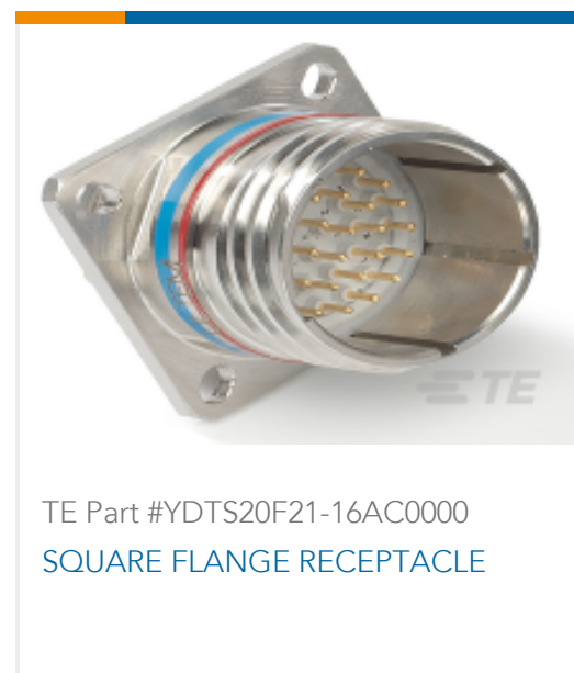
TE Part #YDTS20F21-16AC0000 SQUARE FLANGE RECEPTACLE