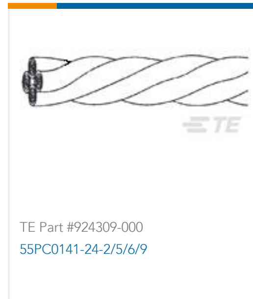
TE Part #924309-000 55PC0141-24-2/5/6/9