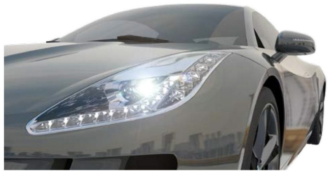
LED headlight cooling