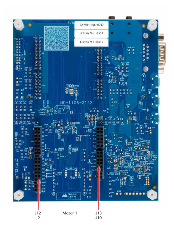
Figure 2: LPC5536-EVK Pin-Out