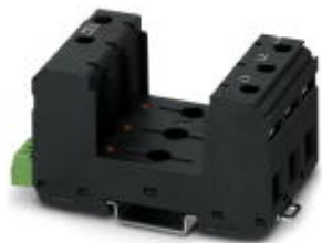
Base element for type 2 arresters of the VALVETRAB MS product range, with remote indication contact. Version for 3-phase power supplies with PEN conductor.

Please be informed that the data shown in this PDF Document is generated from our Online Catalog. Please find the complete data in the user's documentation. Our General Terms of Use for Downloads are valid ( http://phoenixcontact.com/download )