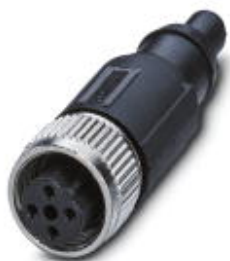
PROFIBUS M12 termination resistor, female connector version

Please be informed that the data shown in this PDF Document is generated from our Online Catalog. Please find the complete data in the user's documentation. Our General Terms of Use for Downloads are valid ( http://phoenixcontact.com/download )