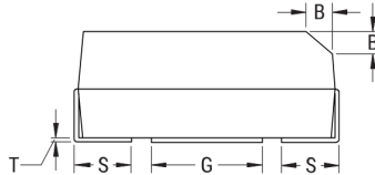
ANODE (+) END VIEW