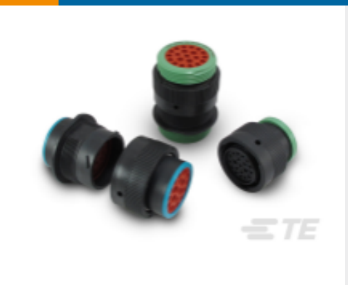
TE Part # CAT-H396-CH8172 DEUTSCH HDP20 Housings