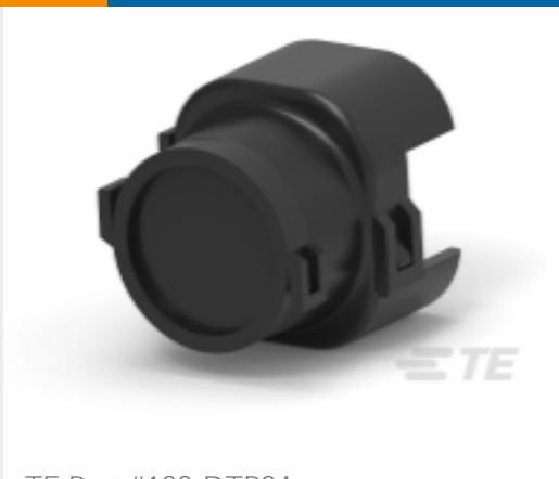
TE Part #180-DTP04 BKSHL, 4P, BLK, PLG, ST, SIDE AB, NW 16