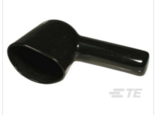
TE Part # HD30-24BT-90-BK BOOT, 24SZ, RA, BLK