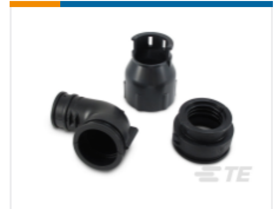
TE Part # CAT-H396-B128 DEUTSCH HDP20 Backshells