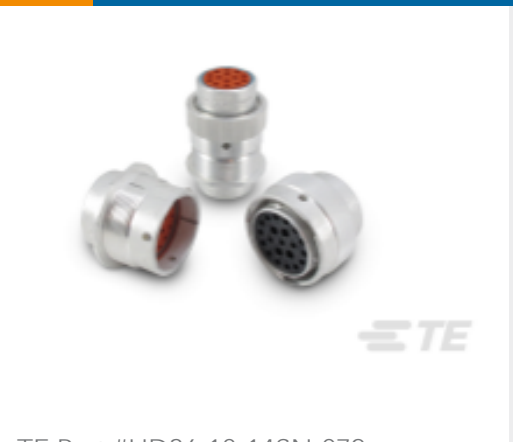
TE Part #HD36-18-14SN-072 DEUTSCH HD30 Housings