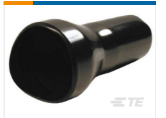
TE Part # HD30-24BT-BK BOOT, 24SZ, ST, BLK