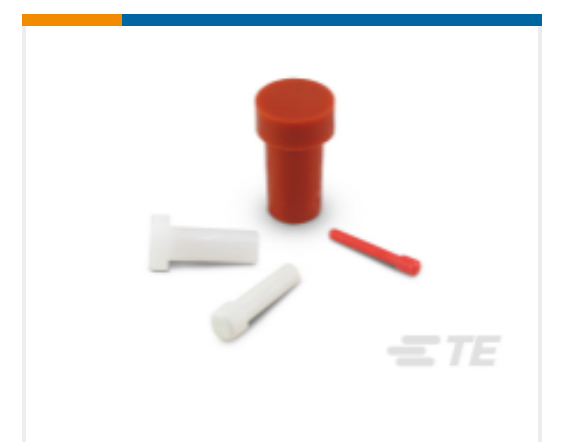
TE Part # CAT-D48-SP729 DEUTSCH Sealing Plugs