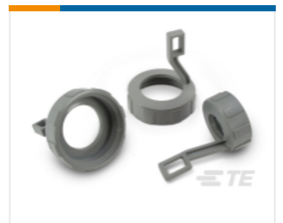
TE Part # CAT-H3910-B128 DEUTSCH HD10 Backshells