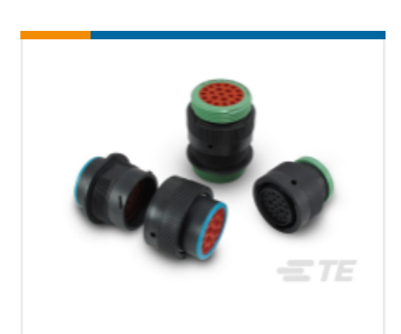
TE Part #HDP24-24-47SE-L015 DEUTSCH HDP20 Housings