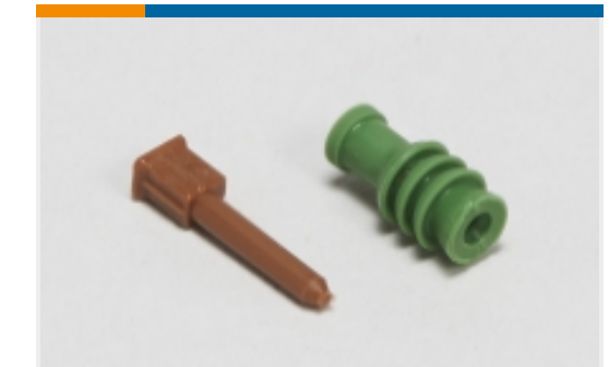
Automotive Seals & Cavity Plugs(10)