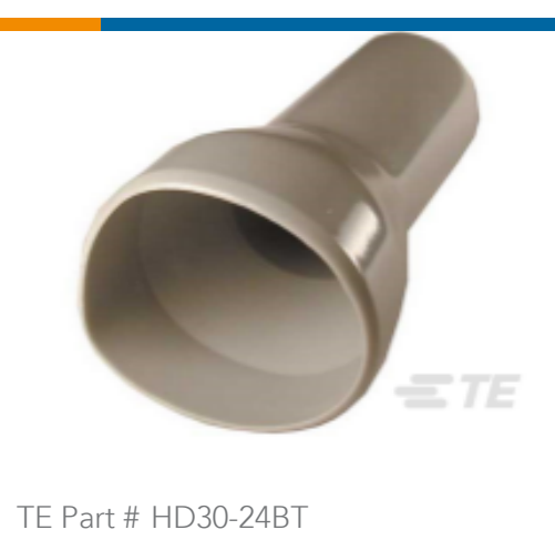
BOOT, 24SZ, ST, GRY