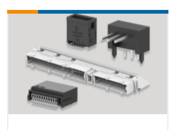
PCB Headers & Receptacles(1)