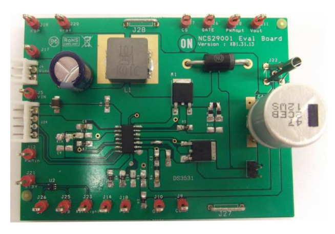
Figure 1. Evaluation Board (not to scale)