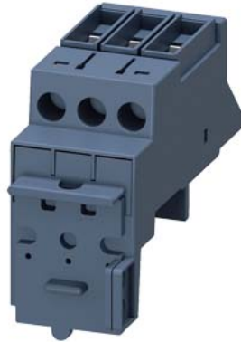
Disconnecter module for circuit breaker Size S2