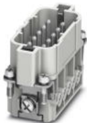
HEAVYCON male insert, A10 series, 10-pos., screw connection

Please be informed that the data shown in this PDF Document is generated from our Online Catalog. Please find the complete data in the user's documentation. Our General Terms of Use for Downloads are valid ( http://phoenixcontact.com/download )