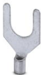
Fork-type cable lug, non-insulated, 1.1 - 2.5 mm 2 , M8

Please be informed that the data shown in this PDF Document is generated from our Online Catalog. Please find the complete data in the user's documentation. Our General Terms of Use for Downloads are valid ( http://phoenixcontact.com/download )