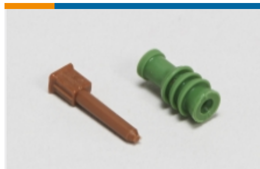
Automotive Seals & Cavity Plugs(11)