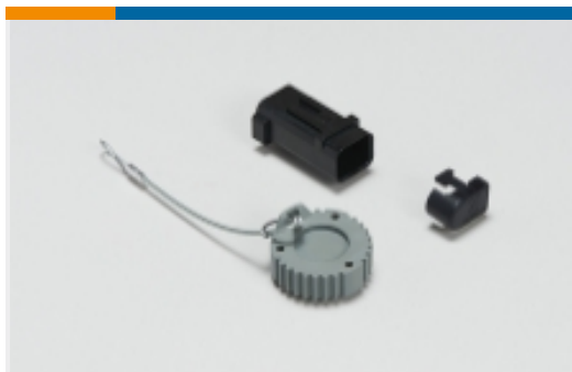
Automotive Connector Caps & Covers (20)