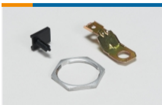
Other Automotive Connector Accessories(6)