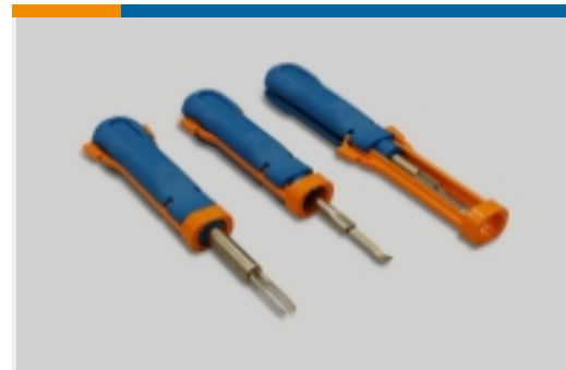
Insertion & Extraction Tools(11)