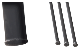
Comparison of monofilaments: flat versus round (magnified for better visibility)