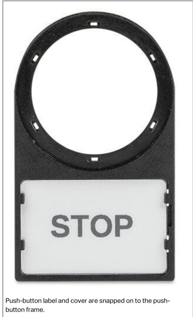
Push-button label and cover are snapped on to the push-button frame.