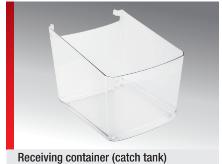
Receiving container (catch tank)