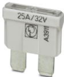
Flat-type plug-in fuse, type C, color code: white, nominal current: 25 A

Please be informed that the data shown in this PDF Document is generated from our Online Catalog. Please find the complete data in the user's documentation. Our General Terms of Use for Downloads are valid ( http://phoenixcontact.com/download )