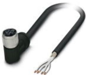
Sensor/actuator cable, 4-position, PE-X halogen-free, black, shielded, free cable end, on Socket angled M12 SPEEDCON, A-coded, cable length: 2 m, For railway applications

Please be informed that the data shown in this PDF Document is generated from our Online Catalog. Please find the complete data in the user's documentation. Our General Terms of Use for Downloads are valid ( http://phoenixcontact.com/download )