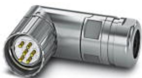
The figure shows the 6-pos. product version with solder contacts

Cable connector, angled, shielded: yes, Screw locking, M23, No. of pos.: 7, type of contact: Pin, Crimp connection, cable diameter range: 3 mm ... 14.5 mm