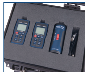
Includes: 2 x R8085 Noise Dosimeter, R8090 Sound Level Calibrator, and R8888 Hard Carrying Case